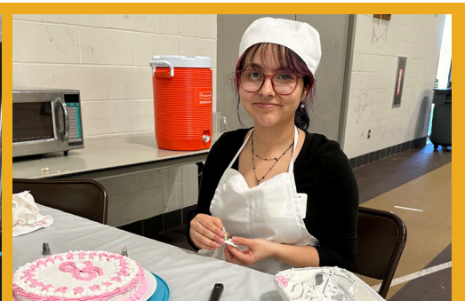
Culinary Skills Challenge