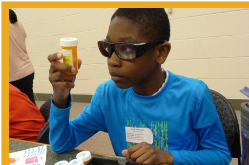
Science and Nature Conference

Funds raised support a variety of regional enrichment opportunities for students such as the Southwest Minnesota Career Expo, Major Madness, Conference for Young Artists, Conference for Young Writers, Creative Writing Contest, Culinary Skills Challenge, First Tech Challenge, Photography Competition, regional Knowledge Bowl competitions, Regional Spelling Bee and the Science and Nature Conference. These opportunities are an extension of the classroom and give students the opportunity to further explore areas of interest in a hands-on fashion.