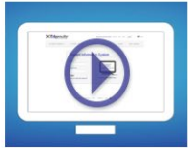
Watch the orientation video

Students AND parents use this link to login. BOOKMARK THIS LINK